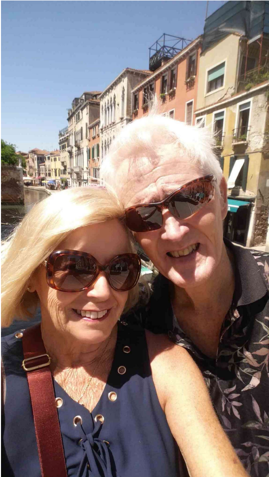
Photo of Lovers in Venizia