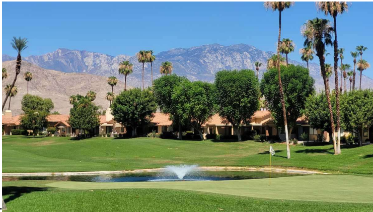
Our home patio view we love every day! Mt San Jacinto