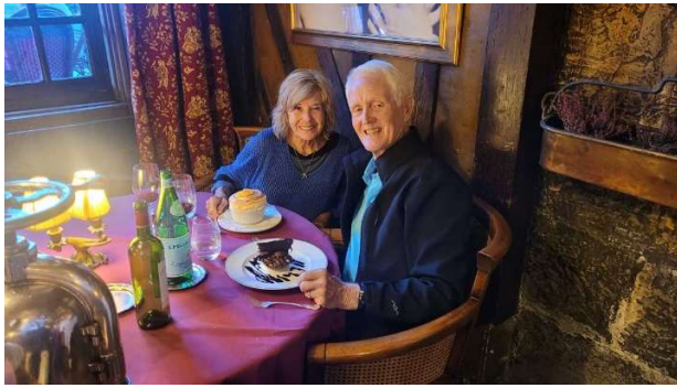
One of our best meals ever at a famous 100 year old restaurant in Rouen, France