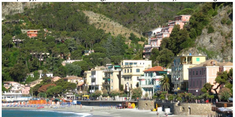
2Monterosso al Mare, Italy--Cinque Terre