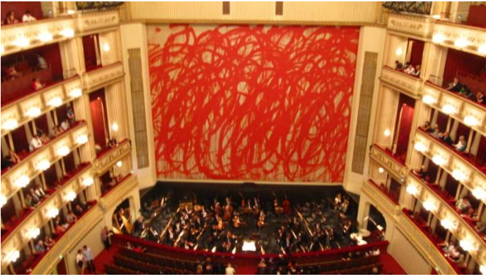
11 Vienna Stadsopera from our seat