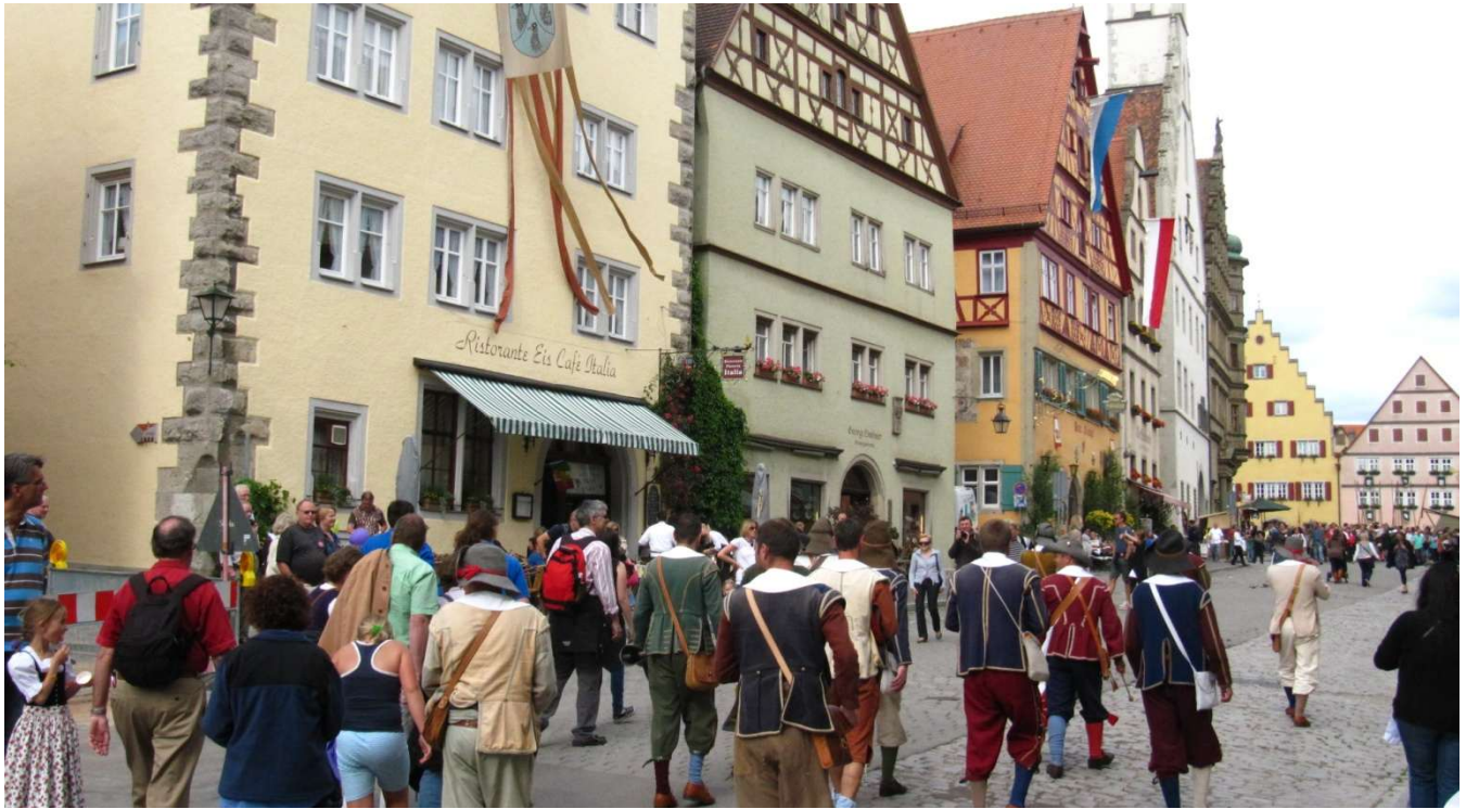
8 Rothenberg - Medieval Festival