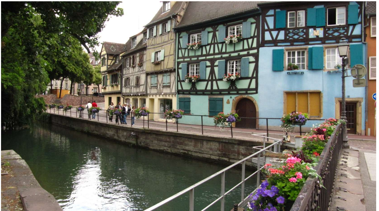
9 Colmar, Alsace France - beautiful canals etc