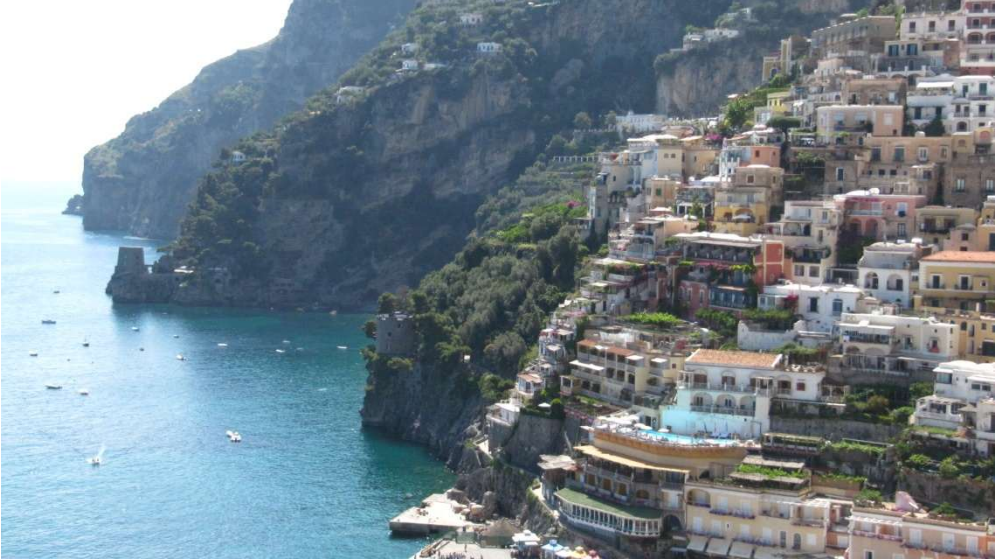
5 More Positano