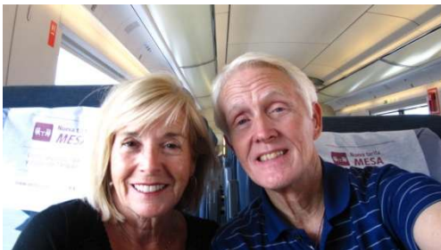
3 Spanish AVE train at 300 kph (186mph)

We saved money by not going to Maui, and we had so much fun with our Eurail pass in 2009, we decided to plan another similar trip. We traveled May 18-June 21 to Madrid, Toledo, and Barcelona (Spain); Nice (France); Cinque Terre and Sorrento (Italy); Innsbruck, Salzburg, and Vienna (Austria); Rothenberg au