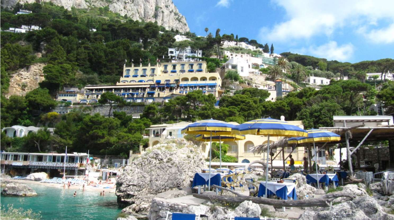
4 Capri - our landing and departing point