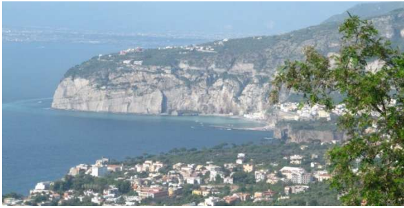
6 Sorrento-Bay of Naples—view from our Hotel