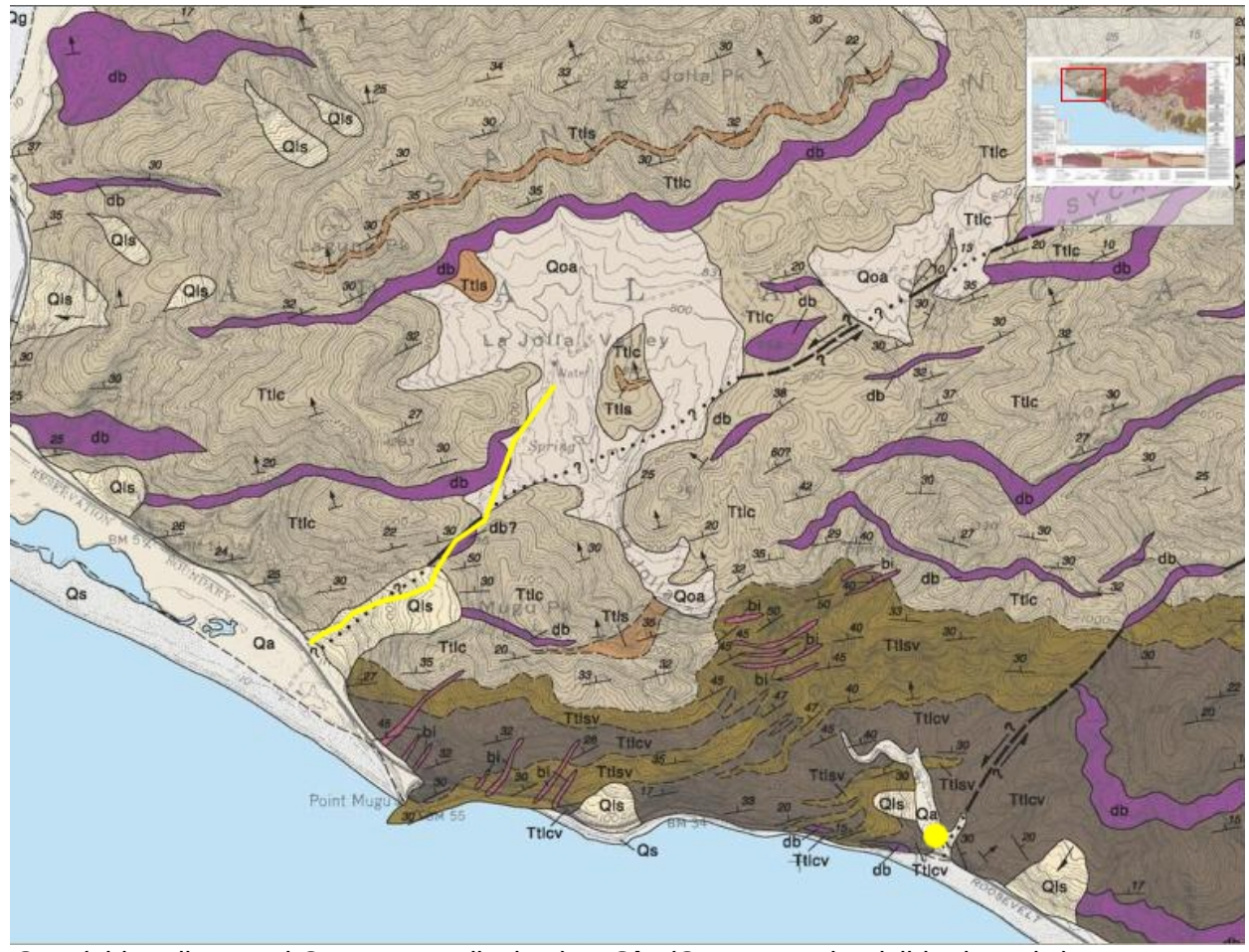
Qoa (older, dissected Quaternary alluvium) Qls (Quaternary landslide deposits) Ttis (Topanga sandstones) TTic (Topanga shales) db (Miocene diabase intrusives)

In the event of emergency, here is the nearest emergency-receiving hospital: